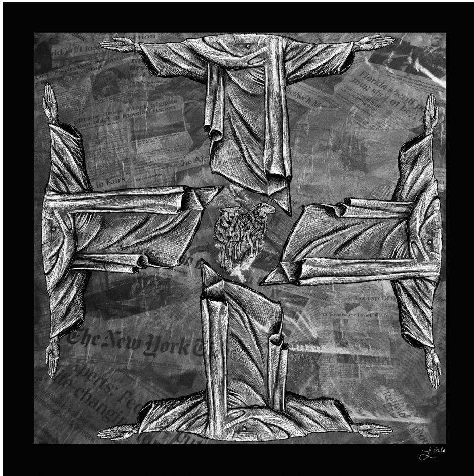
A Wide Embrace | Lisle Gwynn Garrity Newspaper & gold leaf collage with digital drawing