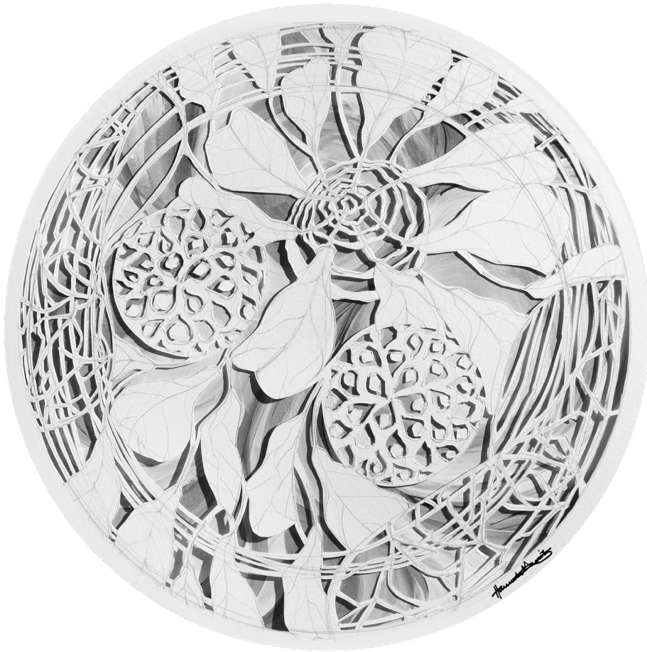
Fig Leafing | Hannah Garrity Paper lace with watercolor

Or perhaps the God figure here is in the space between them all, between the three. The fig tree, this one, begins its leafing in the in-between.