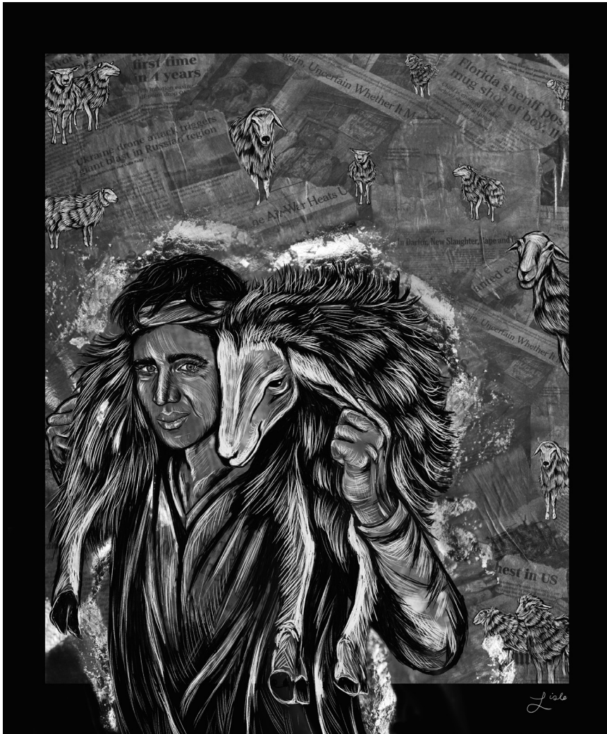
Lost and Found | Lisle Gwynn Garrity Newspaper & gold leaf collage with digital drawing