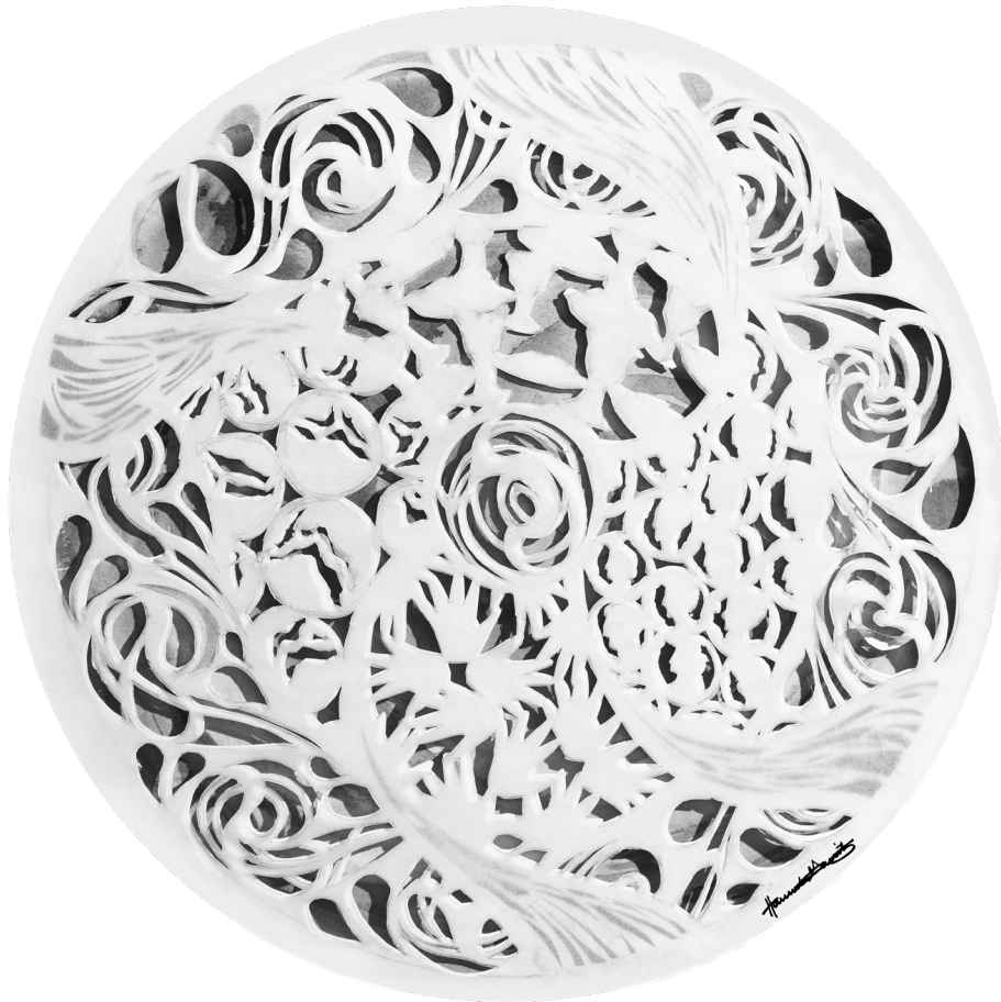
Four Waters at Table | Hannah Garrity Paper lace with watercolor

As Lent begins, how will you align your intentions with your actions?